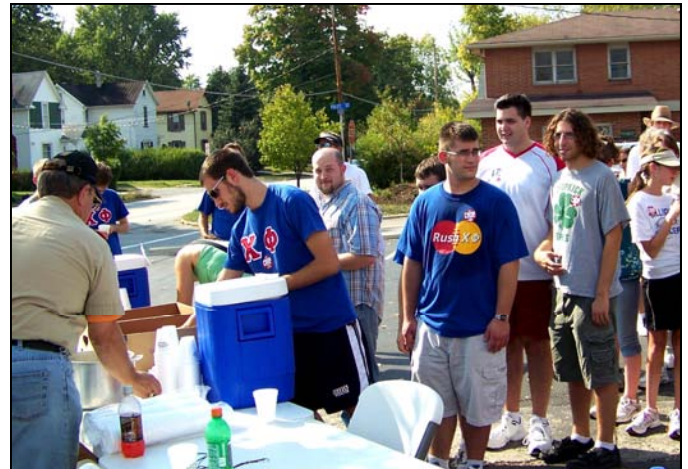
Members of Chi Phi at the Crop Walk water station.