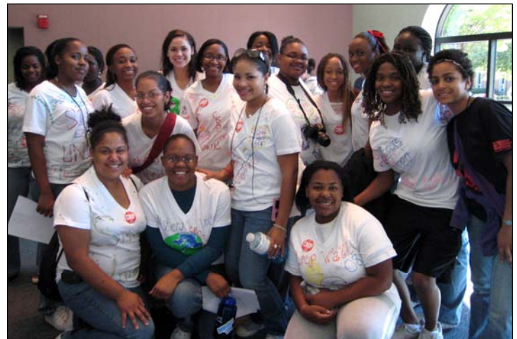
Members of OWU's Sisters United are all smiles as they wait for the walk to begin.

The acronym CROP stands for "Communities Responding to Overcome Poverty". Church World Service is a co-operative ministry of 35 Protestant, Orthodox, and Anglican denominations, providing sustainable self-help and development, disaster relief, and refugee assistance in some 80 countries around the globe. For a list of member denominations, or a copy of the CWS annual report, please visit their website at www.churchworldservice.org .