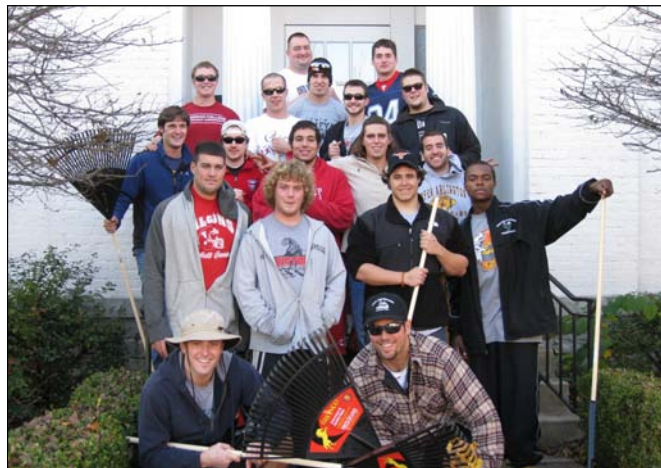
The brothers of Phi Psi gather outside the Andrews House after an afternoon of leaf raking.