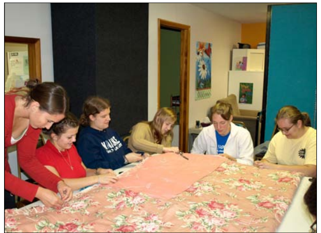
Members sew a sleeping bag from old blankets to donate to Share.