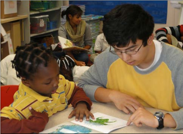
Reading Together At Linden

This year, the Columbus Initiative began its third decade of continuous partnership with the Columbus City Schools. This partnership joins students from Ohio Wesleyan University in tutoring and mentoring relationships with inner-city children from one of the more economically-depressed areas of Columbus, Ohio. The mission of the Columbus Initiative is to help meet the needs of our public school partner, Linden S.T.E.M. Academy. To that end, Ohio Wesleyan students have tutored children in most subject areas, listened to children's concerns, dried tear-filled eyes, raised money for books, helped teachers create materials, cleaned the schoolyard, and helped keep peace in the hallways, lunchroom, and playground. When a new school was built, tutors helped pack the boxes and moved them to the new building. When teachers needed additional chaperones for field trips to the zoo or the pumpkin patch, the tutors