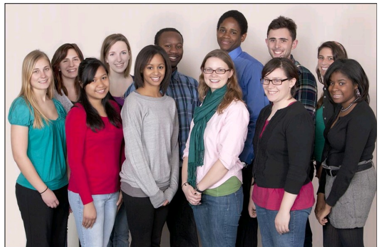
Columbus Initiative Seniors

The Columbus Initiative Award for Excellence in Tutoring and Mentoring is presented to honor graduating seniors who have given time, patience, and great love and commitment to the children of Linden Elementary, our inner-city school partner in Columbus, Ohio. Senior students spent over 200 hours working at Linden – and a few of them have spent nearly 500 hours at Linden during their college careers. Some have volunteered their time to tutor. Others have accessed their Work/Study funds – and it is important to note that working for the Columbus Initiative is a really active job. These students have big hearts and true commitment to their community.