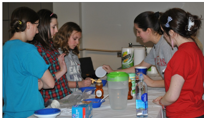
Photo and Story Information Courtesy of: Donna Hughes, Regional Director Girl Scouts of Ohio's Heartland Council

Not only did they plan two special programs for the Girl Scout council, " Food: The Science behind your Kitchen " partnering with OWU Women in Science in February, and, " Relax, Reflect, and Dance " in April, which also included a campus tour, but they assisted local troops with their international program as well. More than forty girls and their troop leaders, visited the OWU Science Center Atrium for the two programs and benefited from the interaction with college women.