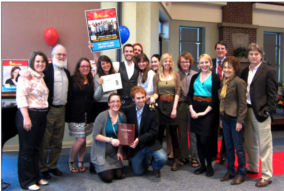
The Happy Residents, Advisers and Enthusiastic Supporters of the Award-Winning Peace & Justice House at the 2011 Golden Bishop Awards Event. (see cover story)