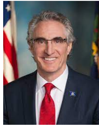
Doug Burgum • 33rd Governor of North Dakota

*Information gathered from candidate’s campaign website.*