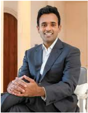
Vivek Ramaswamy • Entrepreneur

Vivek Ramaswamy believes that Donald Trump won the 2020 election and has stated that Mike Pence missed “a historic opportunity to unite this country. He believes absentee and mail in ballots are the source of rampant election fraud, and we need to rework these programs to not allow for long stretches of time for voting. He originally condemned January 6th and criticized election deniers in his book, “Nation of Victims”, but he has turned around and now has the opposite view 2 years later. He has stated he’s committed to pardon former president Trump if he is ever elected president. Vivek Ramaswamy additionally opposes transgender rights, stating that, “there are two genders”. He additionally sees the trans identity to be a mental illness and has called the LGBTQ+ movement a “cult” that wants to “force everyone else to bend the knee to its confused belief system.” He believes that we should not allow for any accommodations in schools or workplaces for trans-identifying people, neither in the bathroom nor in sports.